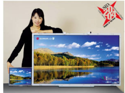
Examples of LG-Philips LCD Panels

In recognition of the dramatic energy savings, LG Philips received the Korea President's Award in November 2006 at a ceremony attended by the Korean Prime Minister, Minister of Industry and Energy and 350 people in energy-related industries. The award was presented for recovering useful heat from waste heat resources in their manufacturing processes, saving 65% energy cost compared to the previous system. LG Philips was the first company to apply the McQuay centrifugal water-to-water heat pump system in Korea.