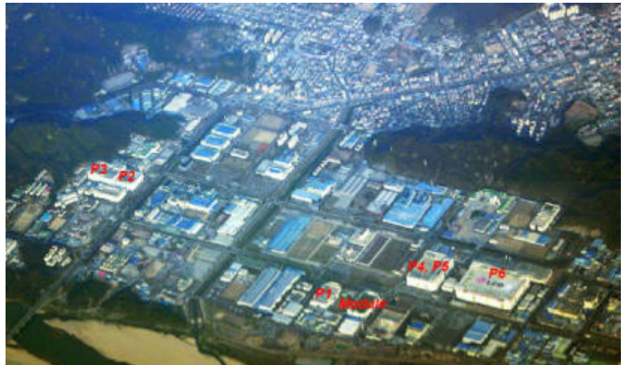
Factory Sites of LG Philips LCD in KooMi, Korea

To stay competitive in the market, LPL knew that it needed to contain its energy usage in its expanding factory in KooMi, Korea. Working with SACI, the McQuay Air Conditioning representative in Korea, LPL