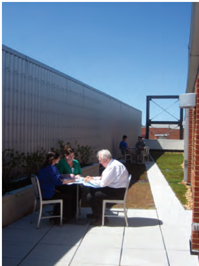
Moseley Rooftop Garden

“The unit was specified with an air-side economizer and a water-cooled evaporative condenser on the end of the unit to make it more efficient and cost effective.”