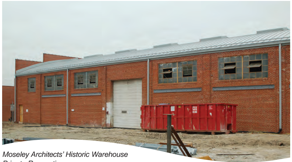
Moseley Architects' Historic Warehouse Prior to Renovation

The McQuay rooftop system is sited on the parking garage that connects to the main building underneath Moseley’s demonstration green roof which features a garden and seating.