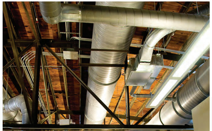
Southern Air's 3D Ductwork Modeling Software Enabled Best Use of Space in the Building's Existing Truss System