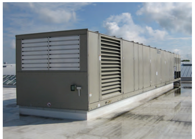
McQuay RoofPak Applied Rooftop System

A leading architectural firm in sustainable design chose McQuay International for its HVAC needs when designing its new headquarters with an eye toward energy efficiency. Moseley Architects selected the McQuay RoofPak Applied Rooftop System when it designed its new headquarters from an old warehouse in Richmond, Virginia.