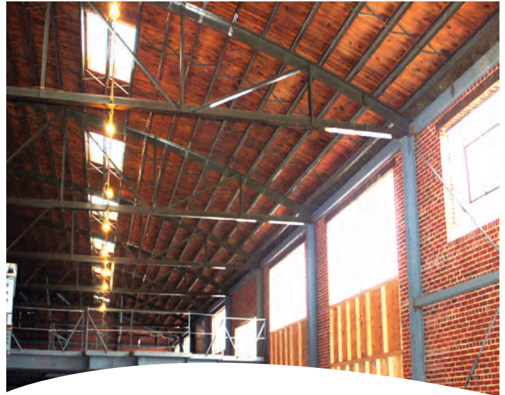
Building Preservation, Rehabilitation, and Sustainability Requirements Involved Detailed Planning to Overcome Challenges

Equipment Rep. - Air Conditioning Equipment Sales, Inc., Richmond, VA