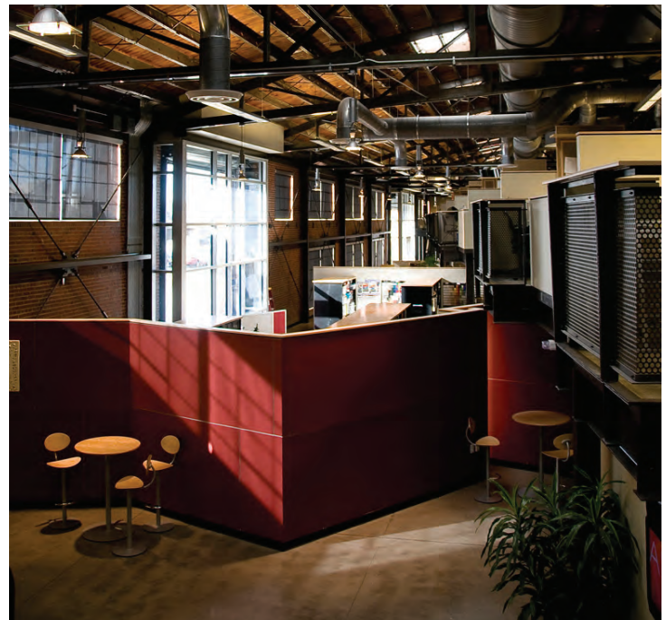
Moseley Architects' Warehouse Interior After Renovation

To date, the McQuay RoofPak unit is performing well and Moseley Architects looks forward to years of continued use in its green-design showcase headquarters.